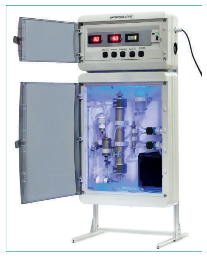
Fig. 6.4.4. STEL-ANK-SUPER-100 device. Electrochemical Systems and Technologies Institute, Moscow, 2019.

STEL devices used in the hospital are small in size, easy to operate, environmentally friendly, and can be installed in any premises. No special long-term training of medical personnel is required to work with STEL devices. Only a medical gown is used as special clothing. The number of prepared solutions corresponds to the actual needs of the departments and can be increased at the request of medical personnel in accordance with the epidemiological situation and the technical characteristics of the equipment. It is possible to obtain anolyte ANK with different concentrations of oxidants according to the modes of using anolyte ANK for infectious diseases of various etiologies. The concentration of oxidants in the prepared anolyte ANK is checked by express analysis (test strips) or, more precisely, by the method of iodometric titration. Neutral anolyte ANK is easy to use and is used with pleasure by the hospital's medical staff. Unlike other preparations, it simultaneously reliably disinfects, washes and sterilizes. The ability to process objects in the presence of patients, as well as the absence of allergic reactions among medical personnel, are also a positive point for choosing anolyte. In addition, Anolyte is a ready-made working solution, the concentration of the active substance in it can be controlled by test strips both at the outlet of the apparatus and in containers for disinfection. Electrochemical activation is not a monotech-