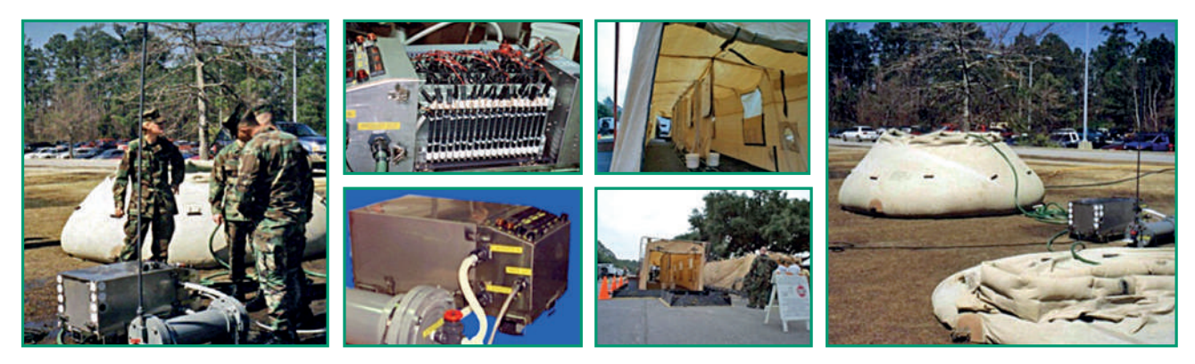
Fig. 6.4.3. Anolyte ANK treatment of servicemen who have left the zones of microbiological or chemical damage, as well as all their equipment and clothing. Marine Corps Base Camp Lejeune, USA. Specialists of the Battelle Memorial Institute (USA) found that anthrax spores die in 0.5% sodium hypochlorite solution in 30 minutes, while in 0.035% Anolyte ANK (15 times less AS concentration) in a few seconds. Anolyte ANK, which is produced by STEL-10N-120–01 and STEL-ANK-60–03 devices (about 60,000 such devices were produced in Russia during the period from 1995 to 2010) has been used in the US Army since 2000.

Currently, anolyte ANK is used at all departments of the hospital: the operating unit, surgical, gynecological, urological, ophthalmological, otorhinolaryngological, endoscopic, and pathological departments, at the hospital emergency room, at nephrological and other therapeutic profile departments, in 6 resuscitation care and intensive therapy departments, at clinical diagnostic laboratory, con-