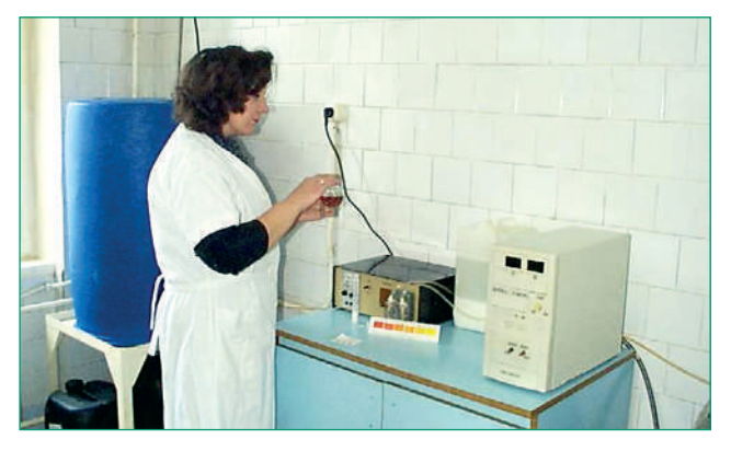
Fig.6.4.1. STEL-10N-120-01 device (model 80) with a capacity of 80 l/h for anolyte ANK. City Clinical Hospital No. 52, 1999.

tral ANK, Anolyte ANK SUPER) as a disinfectant, which is produced in STEL devices (STEL-10N-120–01, STEL-ANK-PRO, STEL- ANK-SUPER), developed by a group of scientists and specialists under the leadership of V. M. Bakhir [16].